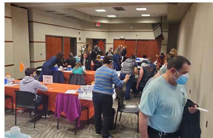
The Sacramento City Unified School District began vaccinating employees and community members this week. The Board proposed high schools return in May.