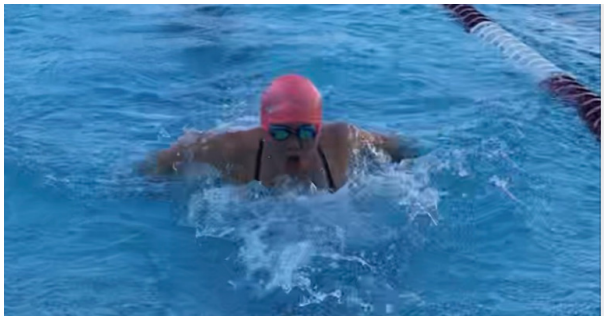
First Home Swim Meet