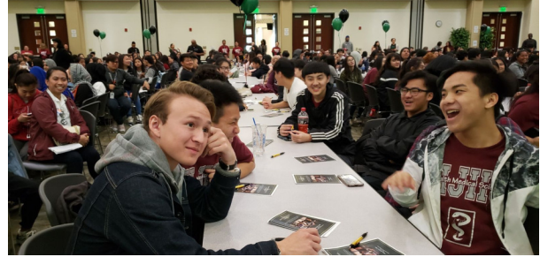
100 Warriors at the API College Day at Sac State