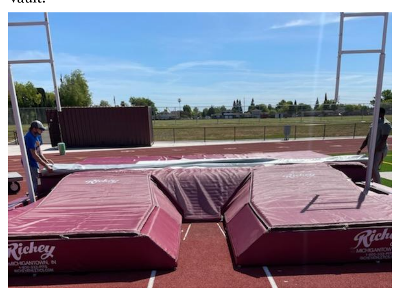
Hiram Johnson athletics invested in a pole vault kit as track and field is one of the outdoor sports Warrior athletes are allowed to participate in.

The track and field team has been working out in preparation for its first competition. Johnson had been able to provide opportunities for sprinters and distance runners, long and high jumpers, shot put and discus throwers, but did not have the equipment to pole vault. As track and field competes, gaining points in the pole vault competition will allow the Warriors to score through pole vault.