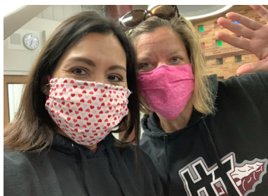
Passing out computers!

Grade level teams met this week on ZOOM! They discussed their on-line learning successes. We are excited about increasing the number of students participating in distance learning.